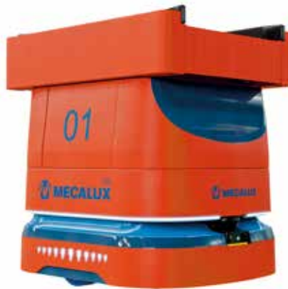
AMR 100 Box

These robots adapt to multiple intralogistics transport requirements. Thanks to their versatility, the AMR line covers a wide range of loads weighing up to 1,500 kg.