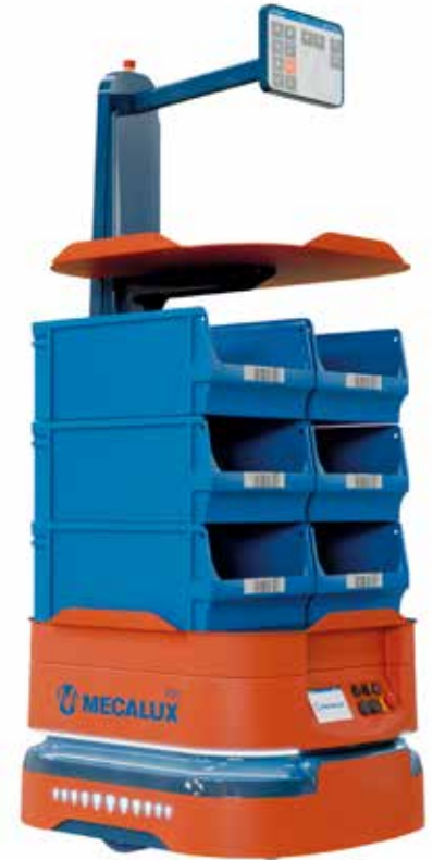
AMR 100 Multi-Box